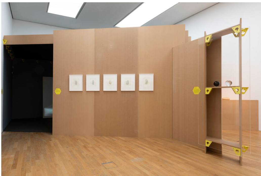
Crystal Fabric Field, 2018. Installation view, Liquid Crystal Display , MIMA, Middlesbrough.

This stems from the exhibition Liquid Crystal Display in which you made Crystal Fabric Field , a sculpture and display structure to house artworks. How did you arrive at the new piece?