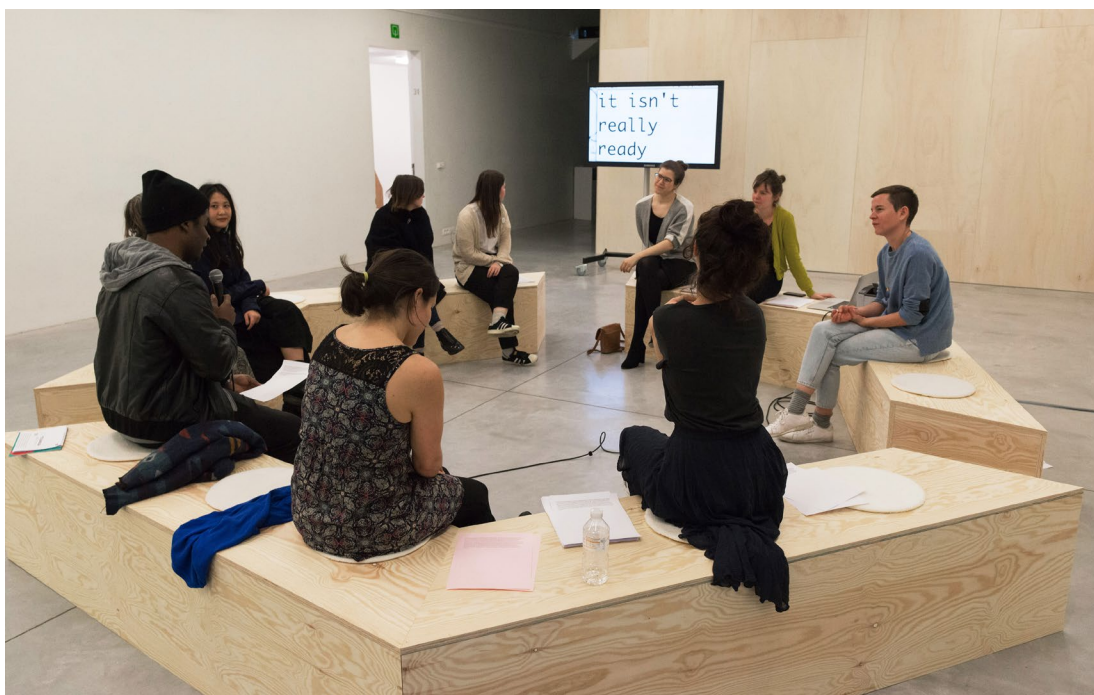
A sentence can be ours and ours , 2016. Live production reading group, Playground Festival, Museum M, Leuven, Belgium.

Afterwards, I use the multiple versions of the texts to construct new, rhythmic, non-linear writing which I further develop into sound works, videos or publications. I think of the texts in these works as interfaces, something that their audience interacts with. To emphasise the audience's agency in the production and transformation of 'sense' I often build structures that carefully choreograph the relationships between the body of the viewer and the images and sounds - screens and speakers - blurring the roles of audience and performer, observer and observed.